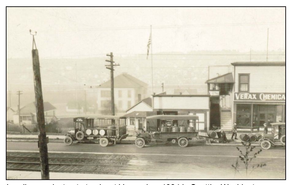
Loading product onto trucks at Verax circa 1924 in Seattle, Washington.

Verax Chemical Company has been manufacturing quality cleaning compounds since 1913. Our name comes from the Latin root veritas , which means honesty. We take that to heart in all aspects of our business. We're a family owned and operated company and we treat our customers as if they were part of our family.